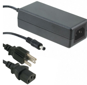
Model BB-PS-SDS Includes NA/USA Power Cord