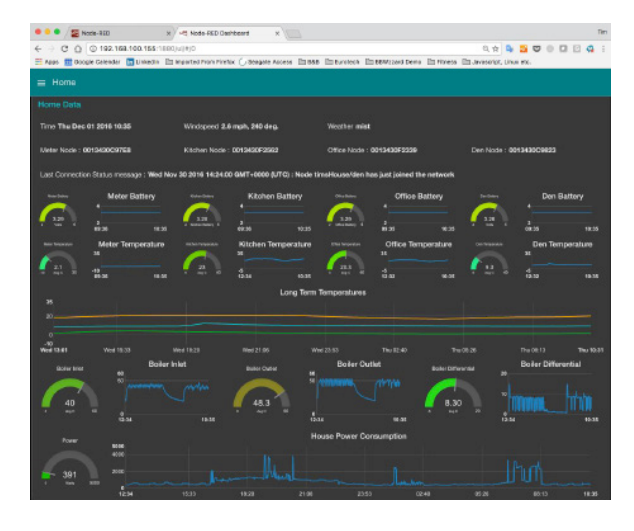
NodeRED - at-a-glance dashboards