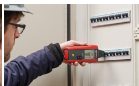
Identify the single correct breaker