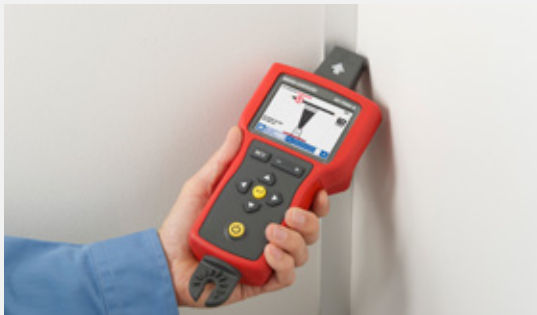
Use the Tip Sensor to trace wires in hard to reach areas.

The SC-7000-EUR signal clamp accessory can be used with the AT-7000-TE Transmitter to induce a signal into energized and de-energized wires when there is no access to bare conductors. Simply clamp around the desired wire to induce the signal, then begin tracing.