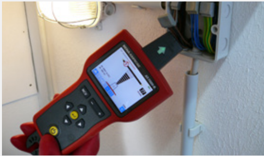
Trace energized or de-energized wires by removing the junction box cover.