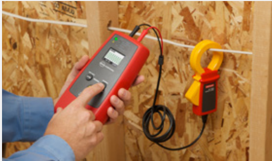
Induce signal with the signal clamp when there is no bare conductor.

Trace energized and de-energized wires enclosed in metal conduit by removing the junction box cover and using the AT-7000-RE Receiver's Tip Sensor to identify the specific wire carrying the transmitted signal generated by the AT-7000-TE Transmitter. Wires in non-metal conduit can be traced directly without opening the junction box and using the AT-7000-RE Receiver's Smart Sensor™.