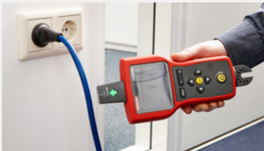
Non-contact voltage (NCV) detection.

When used with the AT-7000-TE Transmitter, the Tip Sensor pinpoints the location of energized and de-energized wires in tight, hard to reach spaces. It easily and accurately traces the targeted energized and de-energized wires in junction boxes, corners, walls, floors and ceilings to a depth of up to 6.1 meters (20 feet).