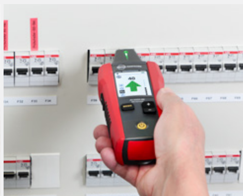
Trace energized and de-energized wires/cables