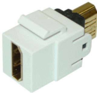
Minimum Connection Depth