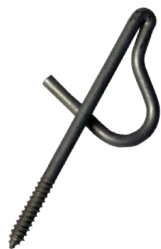
31-00809 Standard "P" House Hook