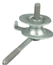
SC26-1 Omni House Hook