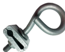
27-00185 "Q" Span Clamp