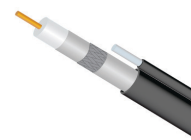
P6ET77VMPRF Series 6 77% Tri Messenger

This product may be protected by one or more patents. For further information, please visit: www.ppc-online.com/patents