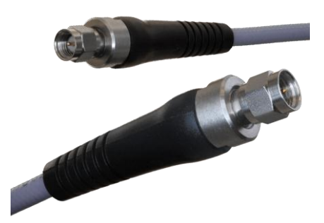
DKT Cable Assembly SMA Male Straight to SMA Male Straight HP190S Cable

Emerson Network Power and the Emerson Network Power logo are trademarks and service marks of Emerson Electric Co. 2010 Emerson Electric Co. pi-DKT.pdf