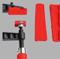
Pressure cap strips SKS (2 pcs./bag)