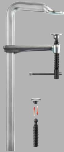
Original BESSEY all-steel screw clamp GZ with tommy bar