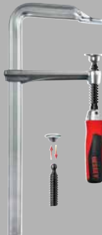
Original BESSEY all-steel screw clamp GZ with swivel handle