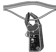
Fig. 2. Illustration of single wire clamped for current measurement.