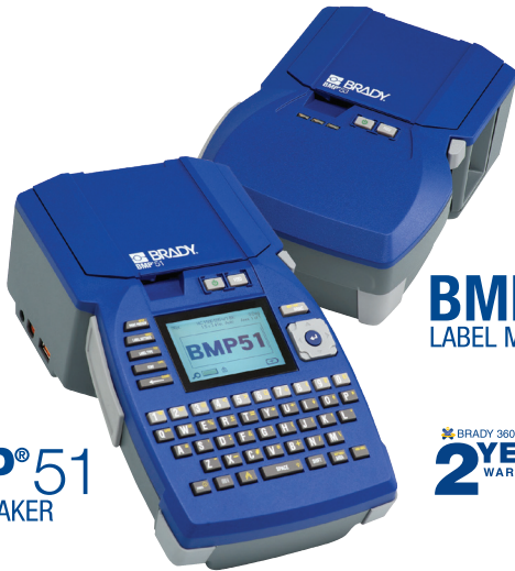
BMP®51 LABEL MAKER