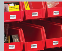
General ID ...and many more!