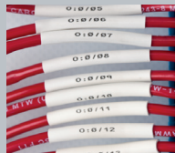
PermaSleeve® Wire Marking Sleeves