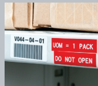
Facility & Safety Identification