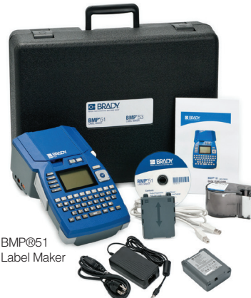
BMP®51 Label Maker

BMP®51 & BMP®53 cartridges with label and print ribbon..... page 302