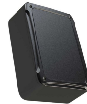
Smooth Face Cover Option