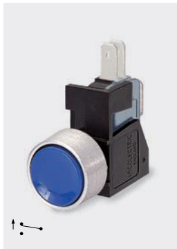
383 2510 K BL