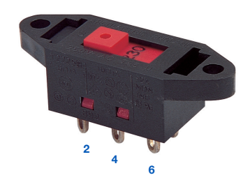
115/230 is preferred