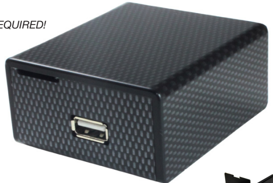
Raspberry Pi A+ not included