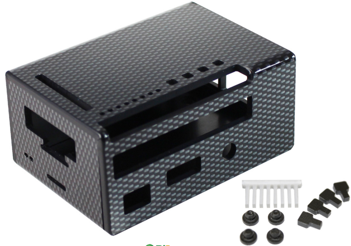
Raspberry Pi B+ and PiFace Digital 2 assemblies not included