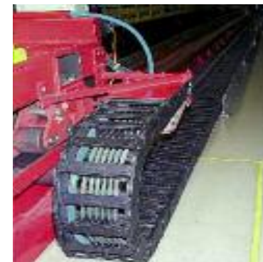
chainflex® CF5/CF6 for shelf control units: long travel in the longitudinal axis. e-chain®: Serie E4/00 with igus® guide trough out of steel

Note: The mentioned external diameters are maximum values and may tend toward lower tolerance limits. G = with green-yellow earth core x = without earth core