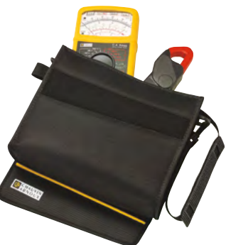
The shoulder bag