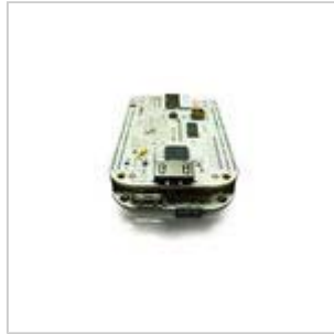
DVI-D Port (HDMI)