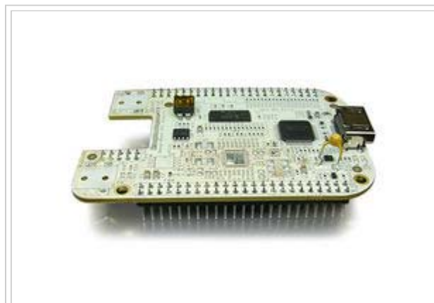
BeagleBone DVI-D Cape

The cape shown in the image to the right is a BeagleBone DVI-D Cape without audio features.