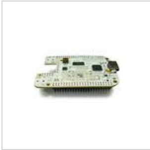
BeagleBone DVI-D Cape