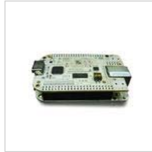
BeagleBone DVI-D Stacked