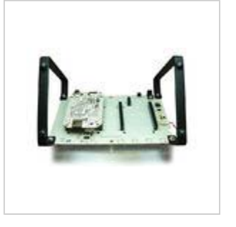
Mounted on Brackets