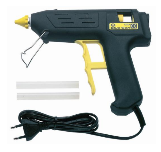
6215A (Euro plug)