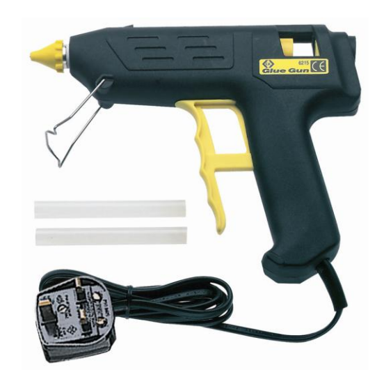
6215 (UK Plug)