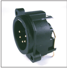
CP 300255 5XNACM/PC90 5 PIN MALE XLR 90° PCB MOUNT