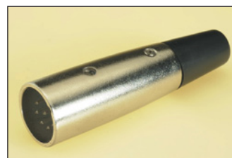
FC6180 7APM/M 7 Pole Male Plug Screw pressure cable clamp