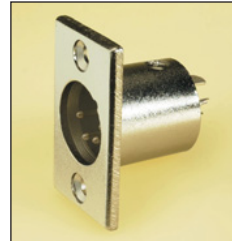
FC6125 4ACM/M 4 Pole Male Socket