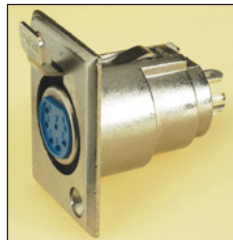
FC6187 7ACF/M 7 Pole Female Socket