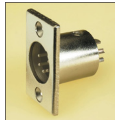
FC6175 5ACM/M 5 Pole Male Socket We also make plastic PCB versions of 5 pin XLR