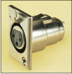
FC6100 3ACF/M 3 Pole Female Socket We also make plastic PCB versions of 3 pin XLR

For applications where Metal Body Connectors are specified, our 'M' Series will meet the most severe specifications. All Electrical Contact parts are silver plated by a process to give low noise levels. No increase in noise level may be expected over 5000 Plug / Un-Plug Operations. Black finish is available subject to viable quantity. Large solder bucket contacts are used to make wiring easy.