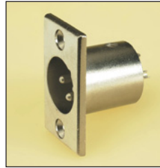
FC6105 3ACM/M 3 Pole Male Socket We also make plastic PCB versions of 3 pin XLR