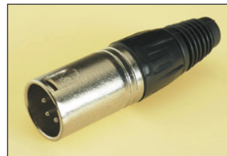
FC6155 4APM/M 4 Pole Male Plug Screw up collet, 6 element cable clamp