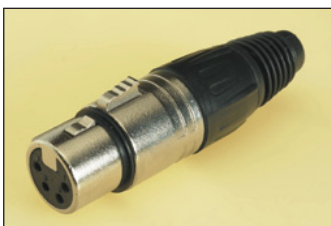
FC6150 4APF/M 4 Pole Female Plug Screw up collet, 6 element cable clamp