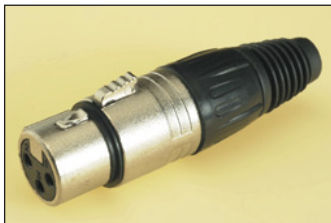
FC6140 3APF/M 3 Pole Female Plug Screw up collet, 6 element cable clamp