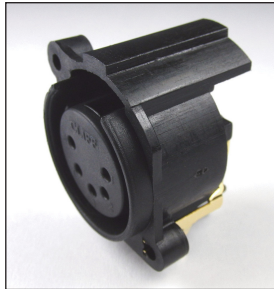
CP 300404 5XNACF/PC90 5 PIN MALE XLR 90° PCB MOUNT WITHOUT LATCH