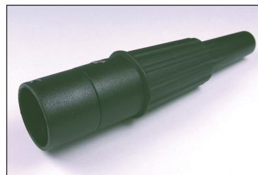
CP3004 APM MALE XLR PLUG