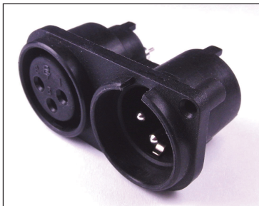
FB6928 MF/PCSXLR DUAL MALE / FEMALE XLR VERTICAL PC MOUNT