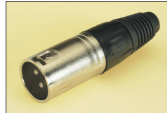
FC6130 3APM/M 3 Pole Male Plug Screw up collet, 6 element cable clamp