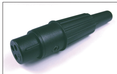
CP3003 APF FEMALE XLR PLUG