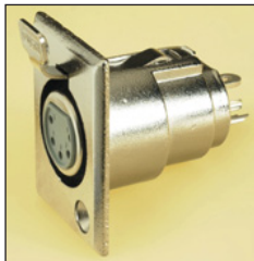
FC6170 5ACF/M 5 Pole Female Socket We also make plastic PCB versions of 5 pin XLR