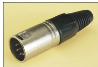
FC6160 5APM/M 5 Pole Male Plug Screw up collet, 6 element cable clamp