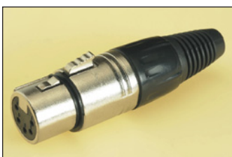
FC6165 5APF/M 5 Pole Female Plug Screw up collet, 6 element cable clamp