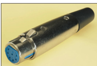
FC6182 7APF/M 7 Pole Female Plug Screw pressure cable clamp