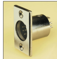
FC6185 7ACM/M 7 Pole Male Socket