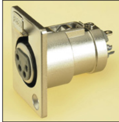
FC6120 4ACF/M 4 Pole Female Socket