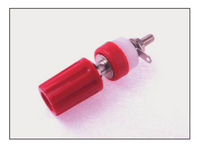
CL1506 - TP/1 RED ASSEMBLED