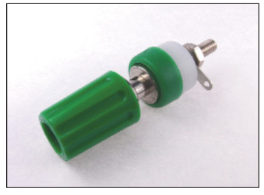
CL1508 - TP/1 GREEN ASSEMBLED