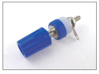
CL1507 - TP/1 BLUE ASSEMBLED