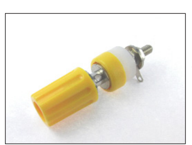
CL1512 - TP/1 YELLOW ASSEMBLED