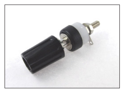
CL1505 - TP/1 BLACK ASSEMBLED

Unassembled parts come with top and bottom insulators, nuts and washers bulk packed.