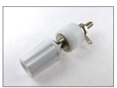
CL1509 - TP/1 WHITE ASSEMBLED