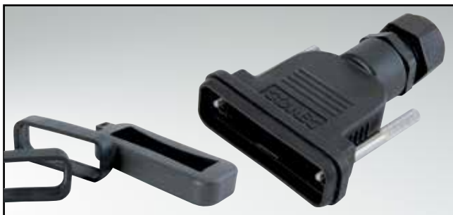
RoHS compliant – CSA listed, File No.: LR 115000-1 – UL listed, File No.: E202784

Straight cable entry – 9-50 pos. – large interior