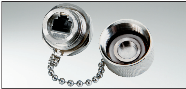
UL listed, File No.: E202784

Inline coupling Cat. 5e and 6A – M28 thread – Metal