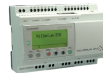
XDP24-E Base 24 I/O Ethernet