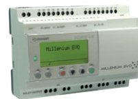
XDP24 Base 24 I/O