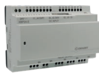
XBP24-E Base 24 I/O Ethernet