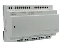
XBP24 Base 24 I/O