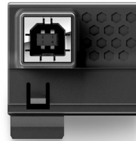
USB interface - Black