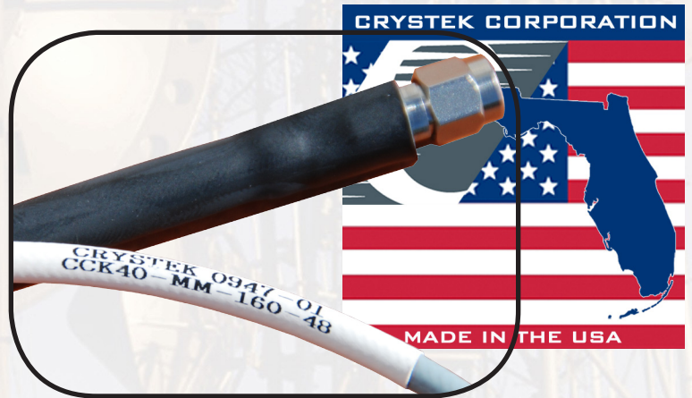
Electrical Test Data Supplied With Each Cable Assembly