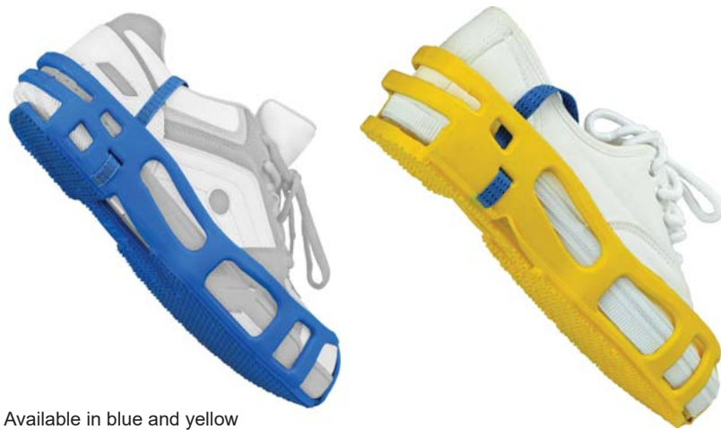
Available in blue and yellow