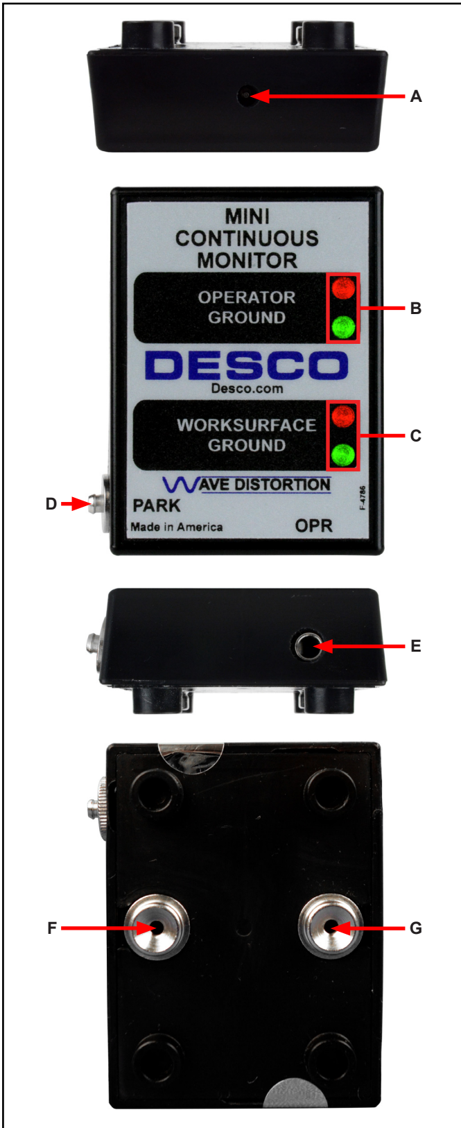
Figure 4. Mini Monitor features and components

A. Power Jack: Connect the included 24VDC power adapter here.