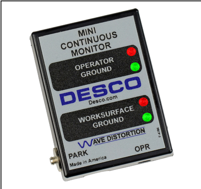
Figure 1. Desco Mini Monitor