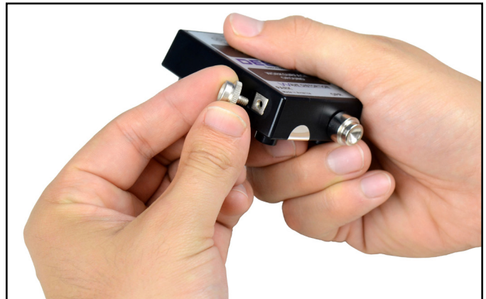
Figure 7. Changing the park snap on the 19243 Mini Monitor

The 19243 Mini Monitor includes an interchangeable 10mm park snap and 10mm banana jack adapter for operators who use wrist cords with 10mm terminations. Use the park snaps' knurled rims to unscrew the 4mm park snap from the monitor and install the 10mm park snap to the monitor. Plug the 10mm operator jack adapter into the monitor's operator jack.