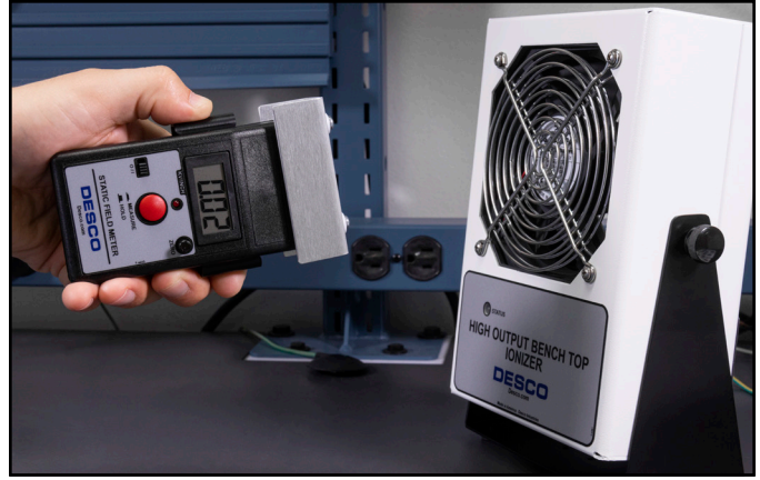
Figure 9. Using the Digital Static Field Meter with Conductive Plate to measure the offset voltage of a benchtop ionizer

NOTE: When testing pulsed ionizer systems, the voltage displayed is constantly changing. This pulse rate may be faster than the display update rate of the Digital Static Field Meter, therefore the displayed voltage is an average of the actual voltage. The output of the Digital Static Field Meter is useful in this situation for more accurate measurements.