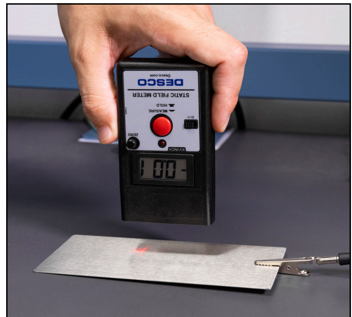
Figure 6. Pointing the Digital Static Field Meter to a grounded surface

Slide the power switch to the right to power the Digital Static Field Meter. Point the top of the Digital Static Field Meter approximately 1 inch (2.5 cm) away from a grounded metal surface. Proper spacing is indicated when the two red bullseyes emitted LED range indicator become centered on top of each other. Turn the rotary zero knob until the Digital Static Field Meter's display reads 0.00.