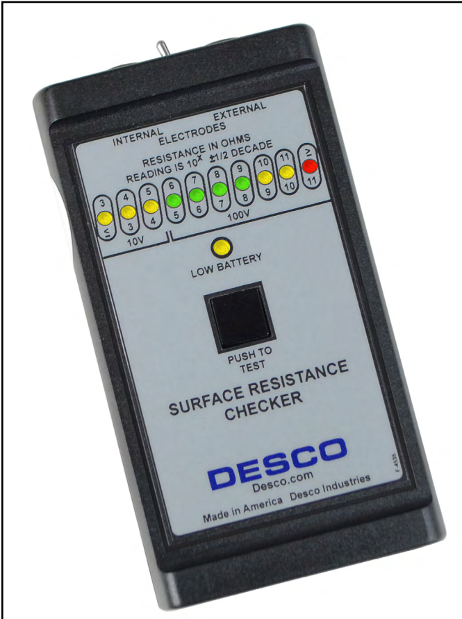
Figure 1. Desco 19640 Surface Resistance Checker