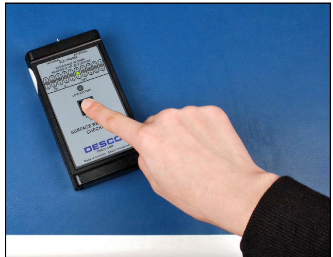
Figure 3. Using the parallel electrodes to measure surface resistance

If the measurement is outside acceptable limits, clean the surface with an ESD cleaner containing no insulative silicone such as Desco 10435 Reztore® Surface & Mat Cleaner, and re-test to determine if the cause of failure is an insulative dirt layer or the ESD worksurface material.