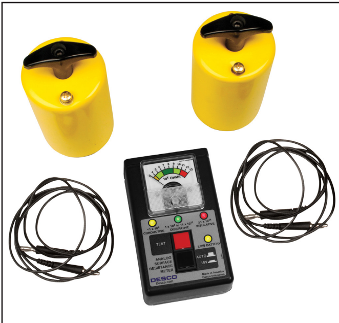
Figure 1. Desco 19784 Analog Surface Resistance Test Kit