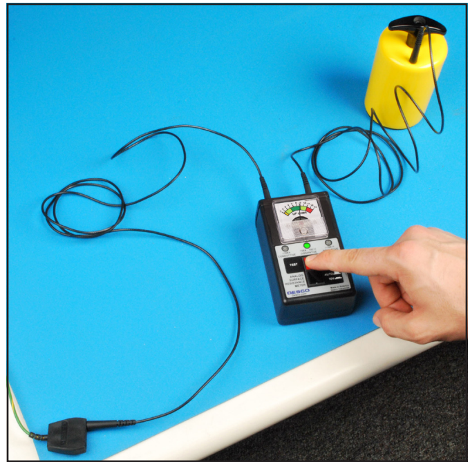
Figure 3. Using the test leads and one 5 pound electrode to measure RTG

CAUTION: If there is a current limiting resistor in the worksurface and the worksurface resistance is lower, the measurement will primarily be the resistance of the resistor. It is recommended to measure RTT particularly if the material color is black.