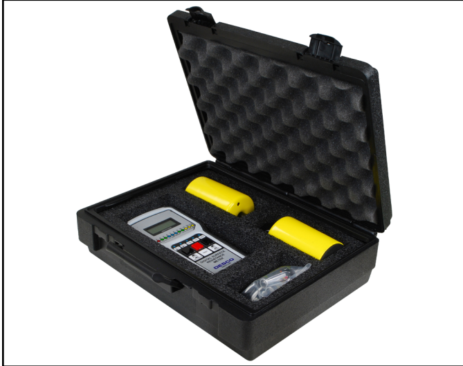
Figure 2. Desco 19787 Digital Surface Resistance Meter Kit