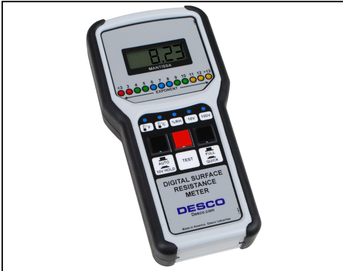
Figure 3. Desco 19788 Digital Surface Resistance Meter