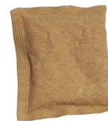
Desiccant in Kraft Pouch