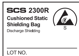
Label placed on Cushioned bag