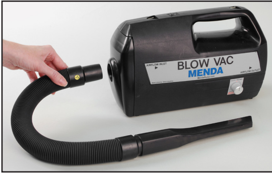
Figure 3: Connecting the hose to the airflow inlet.