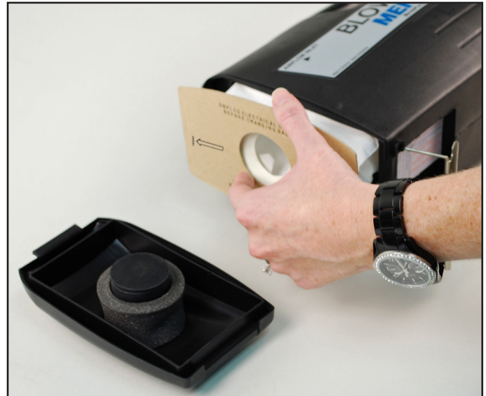
Figure 5: Removing and Changing the Filter