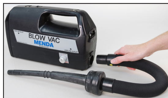
Figure 2: Connecting the hose to the airflow outlet.