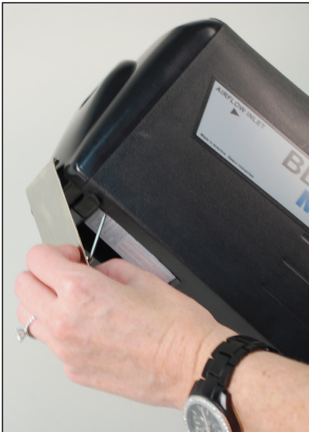
Figure 4: Releasing the Filter