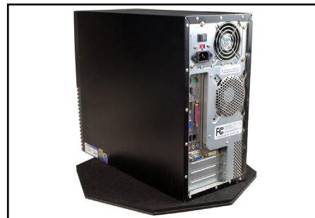
47201 in use