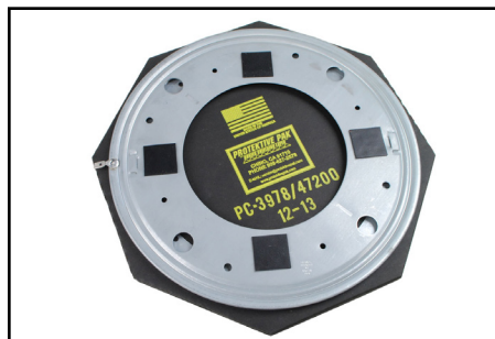
Galvanized Steel Turntable