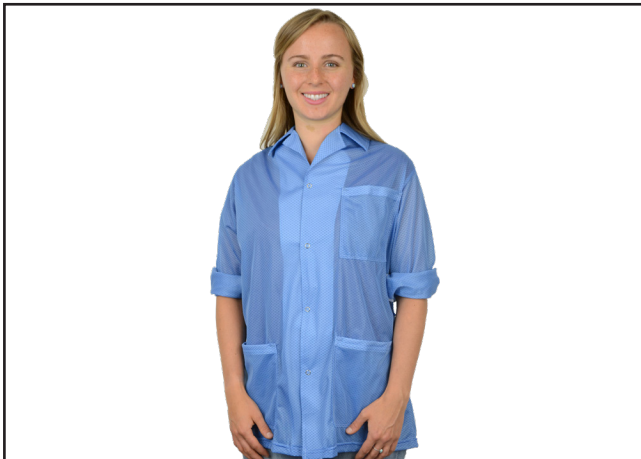
Figure 1. Desco Statshield® Smocks with Convertible Sleeves and Snaps Cuffs.