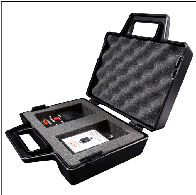
Figure 3. Air Ionizer Test Kit and Carrying Case