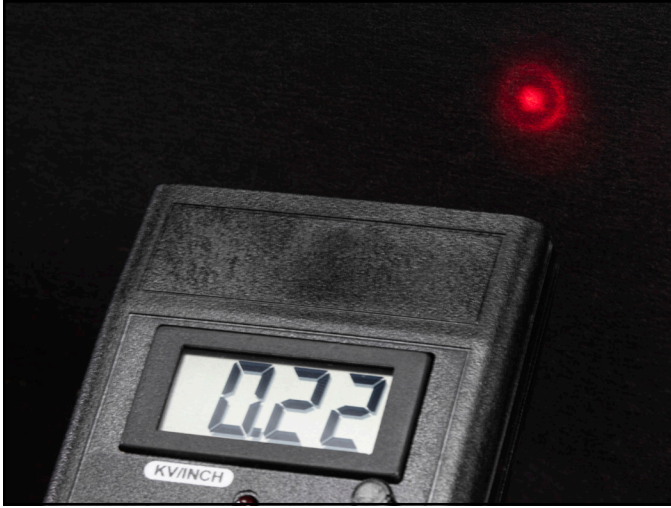
Figure 7. Aligning the two bullseyes emitted by the LED range indicator