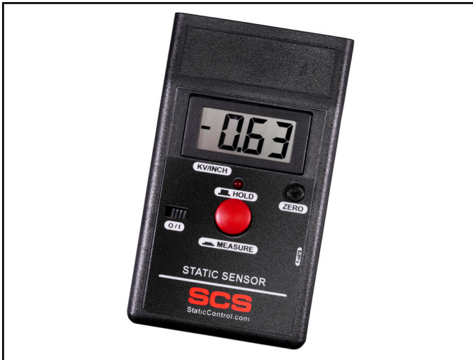
Figure 1. SCS 770716 Static Sensor