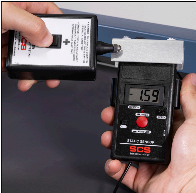
Figure 10. Using the Charger to apply a charge onto the Conductive Plate

NOTE: A ground path must be provided between the touch plate of the Charger and the ground reference of the Static Sensor. This is normally provided by holding the Charger in one hand and the Static Sensor with Conductive Plate in the other.