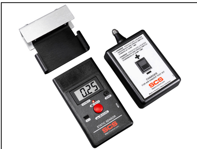
Figure 2. SCS 770717 Air Ionizer Test Kit