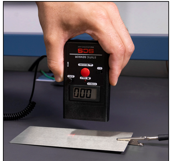
Figure 6. Pointing the Static Sensor to a grounded surface

Slide the power switch to the right to power the Static Sensor. Point the top of the Static Sensor approximately 1 inch (2.5 cm) away from a grounded metal surface. Proper spacing is indicated when the two red bullseyes emitted LED range indicator become centered on top of each other. Turn the rotary zero knob until the Static Sensor's display reads 0.00.