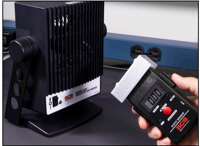
Figure 9. Using the Static Sensor with Conductive Plate to measure the offset voltage of a benchtop ionizer

NOTE: When testing pulsed ionizer systems, the voltage displayed is constantly changing. This pulse rate may be faster than the display update rate of the Static Sensor, therefore the displayed voltage is an average of the actual voltage. The output of the Static Sensor is useful in this situation for more accurate measurements.