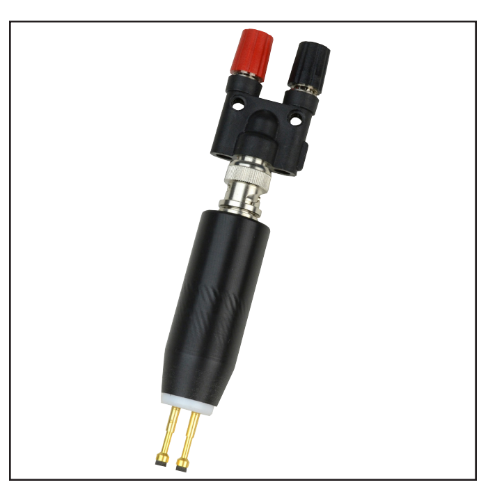
Figure 1. SCS 770757 Two-Point Resistance Probe