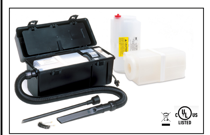
Figure 1. 497AJK HEPA Vacuum.