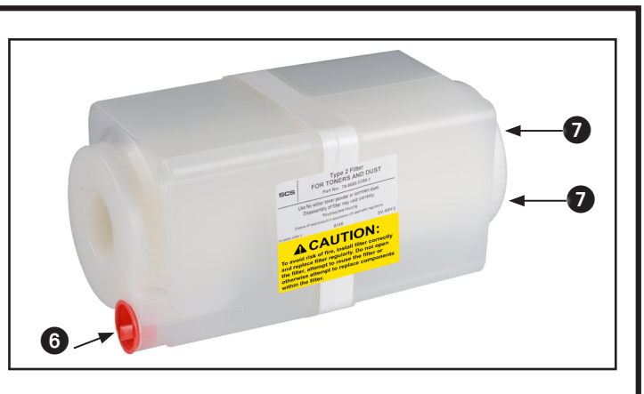
Figure 3. How to replace the Electronic Service Vacuum Filter.

The Electronic Service Vacuum is designed for use with disposable SCS Filters. The filters must be replaced on a regular basis. Frequency of filter replacement depends on the type and frequency of use of the Electronic Service Vacuum.