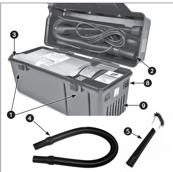
Figure 2. How to operate the Electronic Service Vacuum.