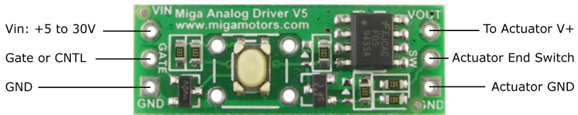
Miga Analog Driver V5 -Pinout Diagram

The MAD-V5 allows either push-button operation, or external GATE (CNTL) signals to actuate the MigaOne until the END limit is reached (goes LOW). The MAD-V5 then cuts power momentarily, preventing overheating of the SMA wires. The Gate transistor allows up to 30V input, but it is recommended to use logic (2.5 to 5-Volt) levels. Pulse-Width-Modulated (PWM) signals can be applied at the Gate to control the actuation speed for a set voltage. For instance, the application of +28VDC power to the MigaOne would result in very fast actuation (~70ms). But with a PWM signal with a 50% duty cycle [ T_{on}/(T_{on}+T_{off}) ], the actuation speed would be significantly reduced: offering simple PWM speed control of the MigaOne actuators.