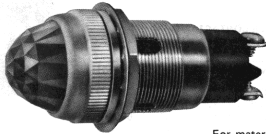
103-3502-1331-403 Torpedo Faceted lens

For materials and finishes of products in this group, see preceding page.