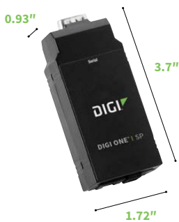
DigiOne® SP - FRONT

For a full list of accessories, visit www.digi.com