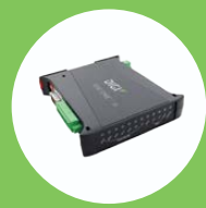
DIGI ONE® IA