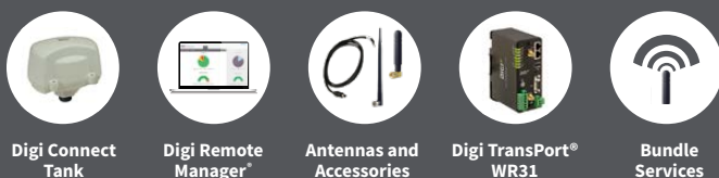
Digi Connect Tank