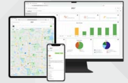
Manage this device with Digi Remote Manager