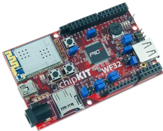
The chipKIT WF32 board.

The chipKIT WF32 is based on the popular Arduino™ open-source hardware prototyping platform and adds the performance of the Microchip PIC32 microcontroller. The WF32 is the first board from Digiilent to have a WiFi MRF24 and SD card on the board both with dedicated signals. The WF32 board takes advantage of the powerful PIC32MX695F512L microcontroller. This microcontroller features a 32-bit MIPS processor core running at 80Mhz, 512K of flash program memory, and 128K of SRAM data memory.